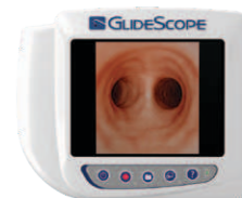
GlideScope® Video Monitor