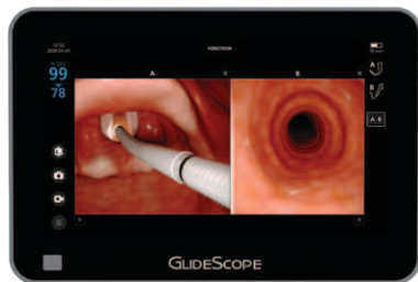
GlideScope® Core™ 15