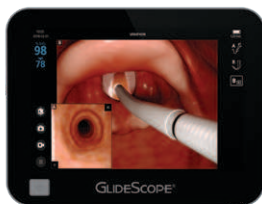
GlideScope® Core™ 10